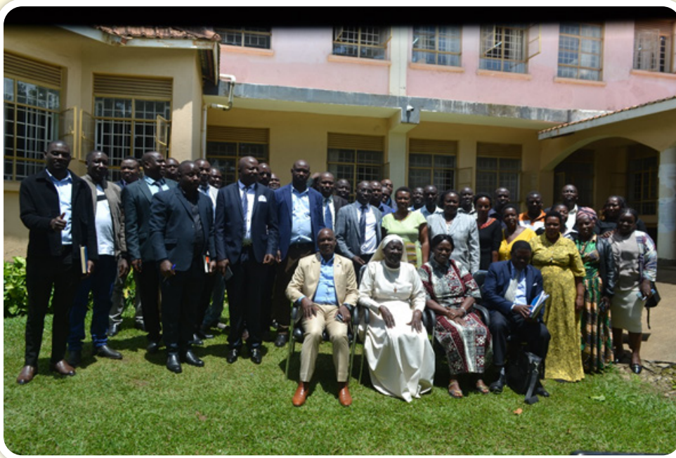
Participants posing for a group photo shortly after the meeting on Monday