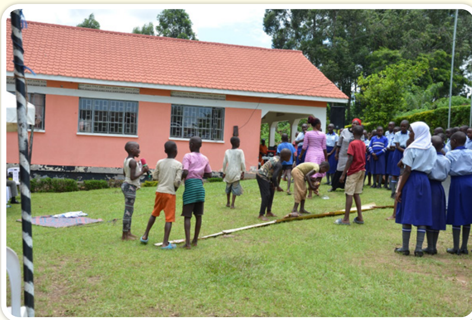
Pupils demonstrating how water contamination happens at rivers and streams.

plans are aimed at strengthening service delivery