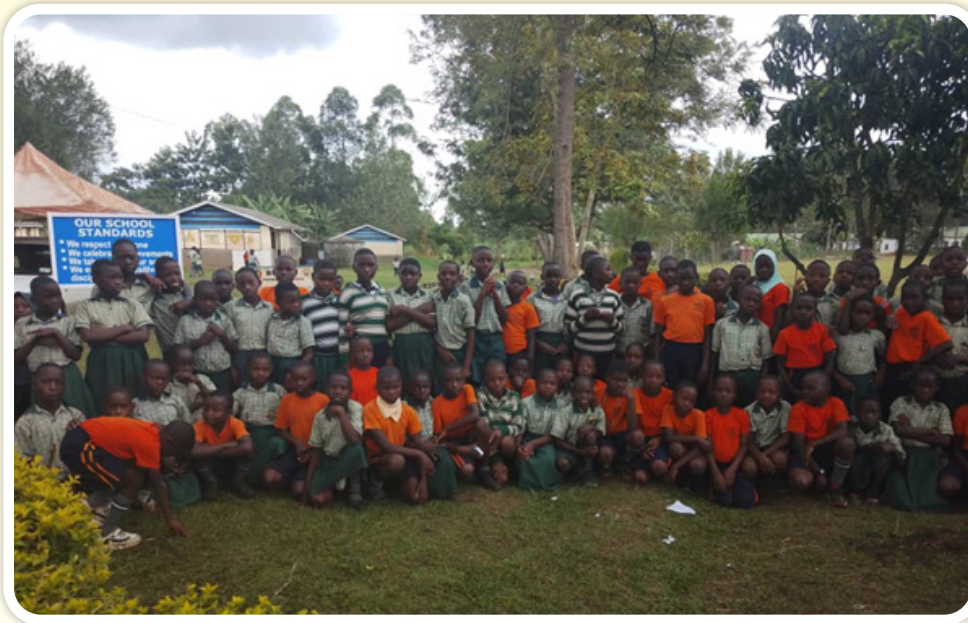
The Pupils Engaged in Art and Craft Classes

excels in extracurricular activities, particularly in debating, and has made a mark through its involvement in the Rwenzori Peer Educators Club.