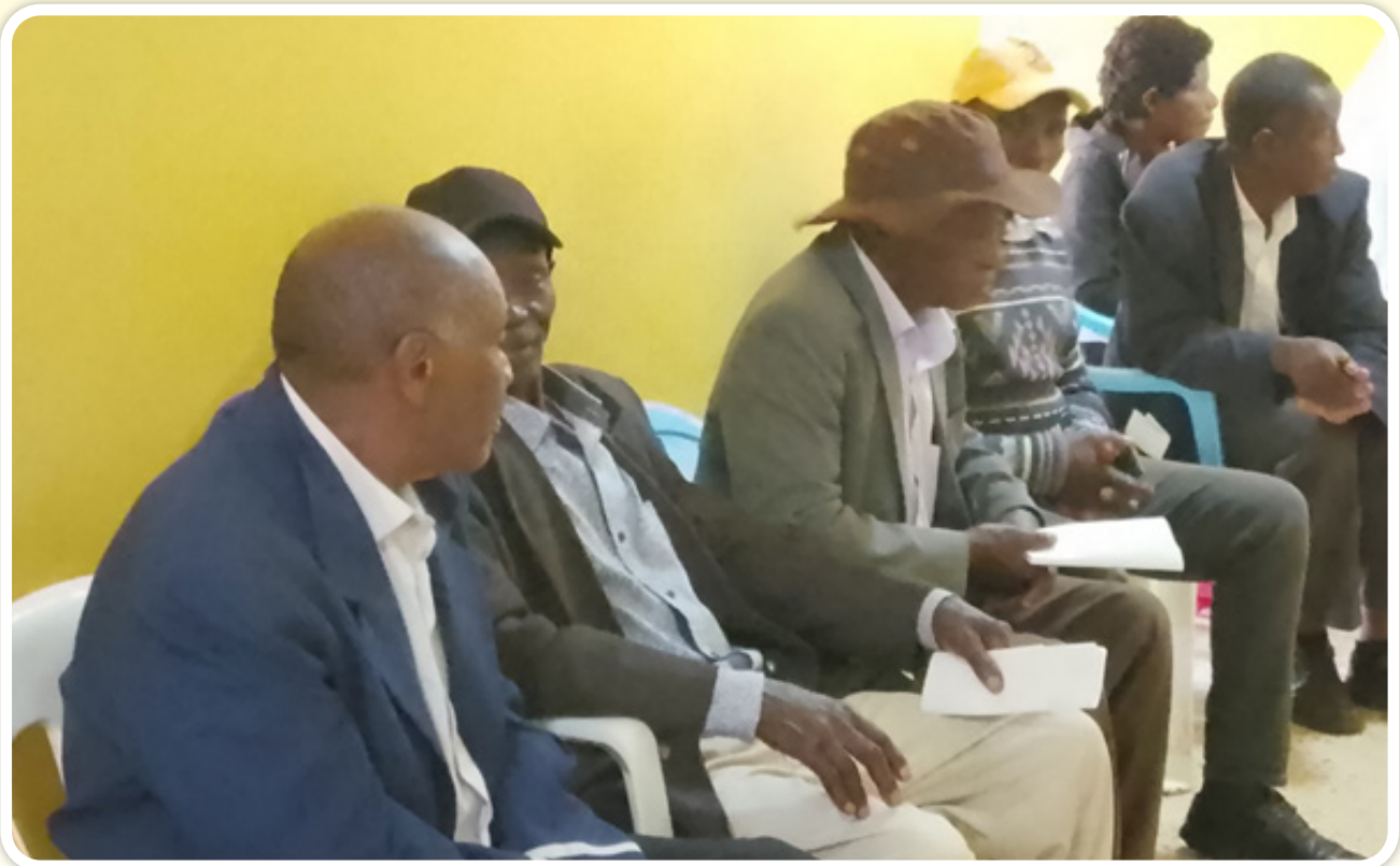
Patients on Waiting List

are excellent, and the health workers are very welcoming,” she said.