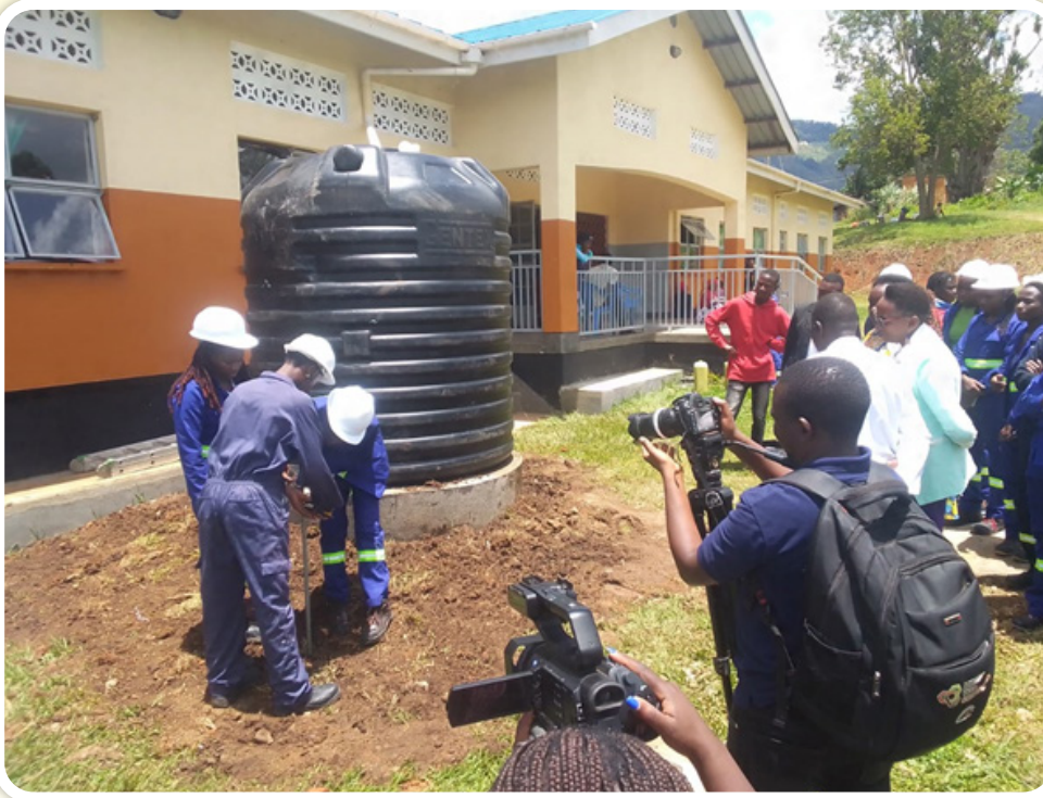
The student engineers install a water tank at the facility.