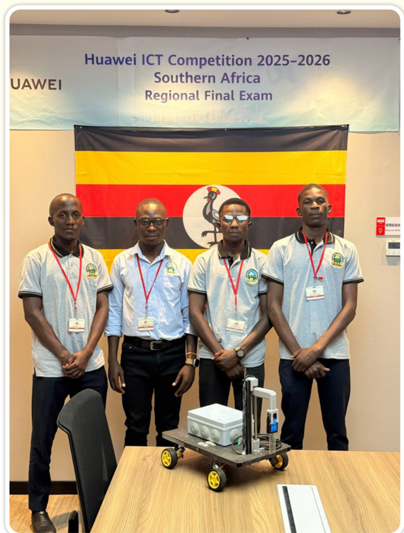
Students of the Mountains of the Moon University (MMU) pose for a photo after their win.

project, AgriChain. This artificial intelligence-driven solution, developed using MindSpore, aims to revolutionize agriculture across Africa by improving efficiency,