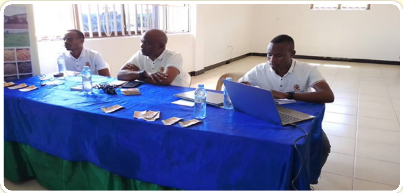
Team of facilitators during the meeting

and agricultural extension workers. The focus was on promoting awareness of Agricultural Credit Facilities and the Small Business Recovery Fund (SBRF).