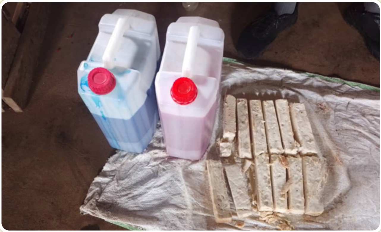
The Liquid and Bar Soap made by Busiita Children