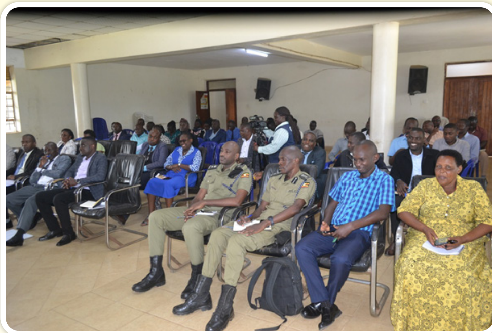
Participants during the engagement meeting on Monday

coordination and accountability, noting that effective service delivery requires joint efforts from all stakeholders.