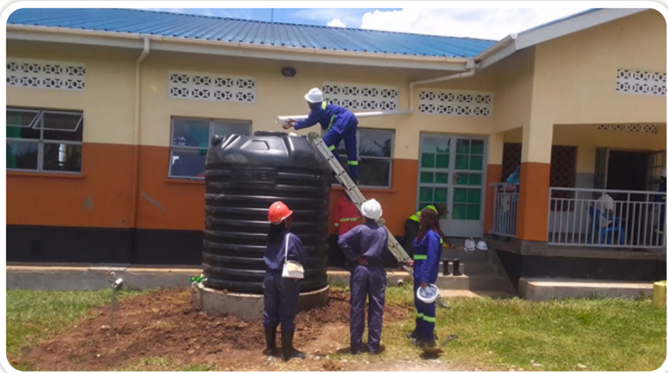
Kicwamba Students renovating the maternity ward at Kicwamba Health Center III in Kabarole.

emphasized the institution's long-standing history since its establishment in the 1940s as a government institution equipped with necessary structures and equipment. However, they expressed concern over the low