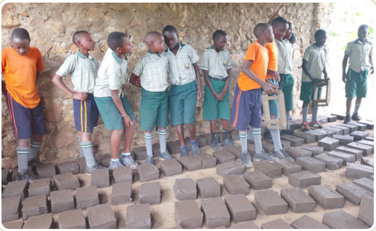
Brick Laying Class Pose in a Photo

are integrated into the daily curriculum.