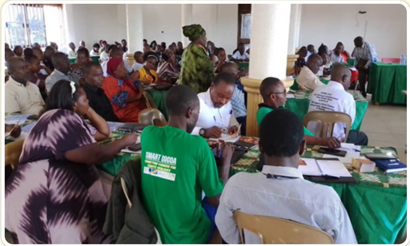
Invited participants during the engagement meeting.