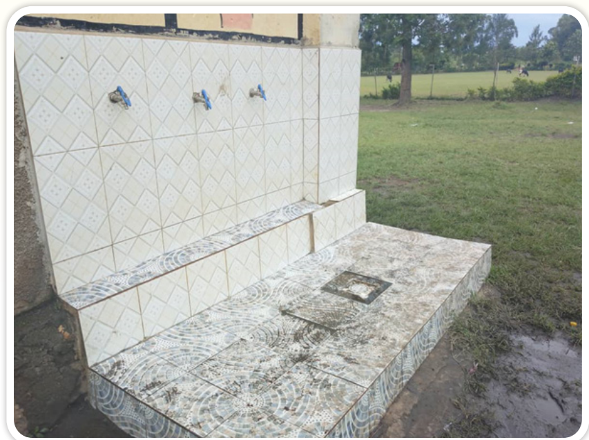
The Water Source that provide clean and safe water to children.