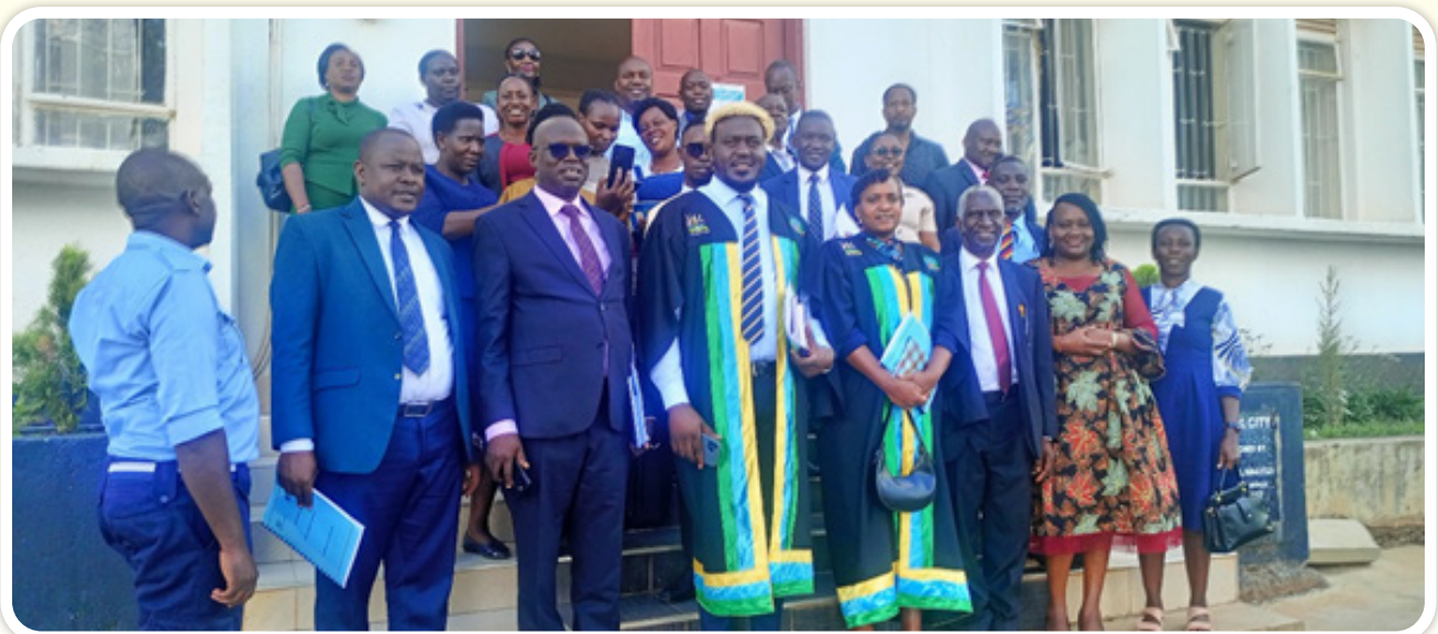
Fort Portal City Technocrats and Political Wing at Mbarara City Headquarters on Wednesday.