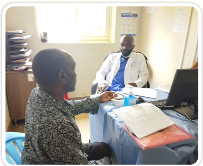
A Doctor Attending to a Patient