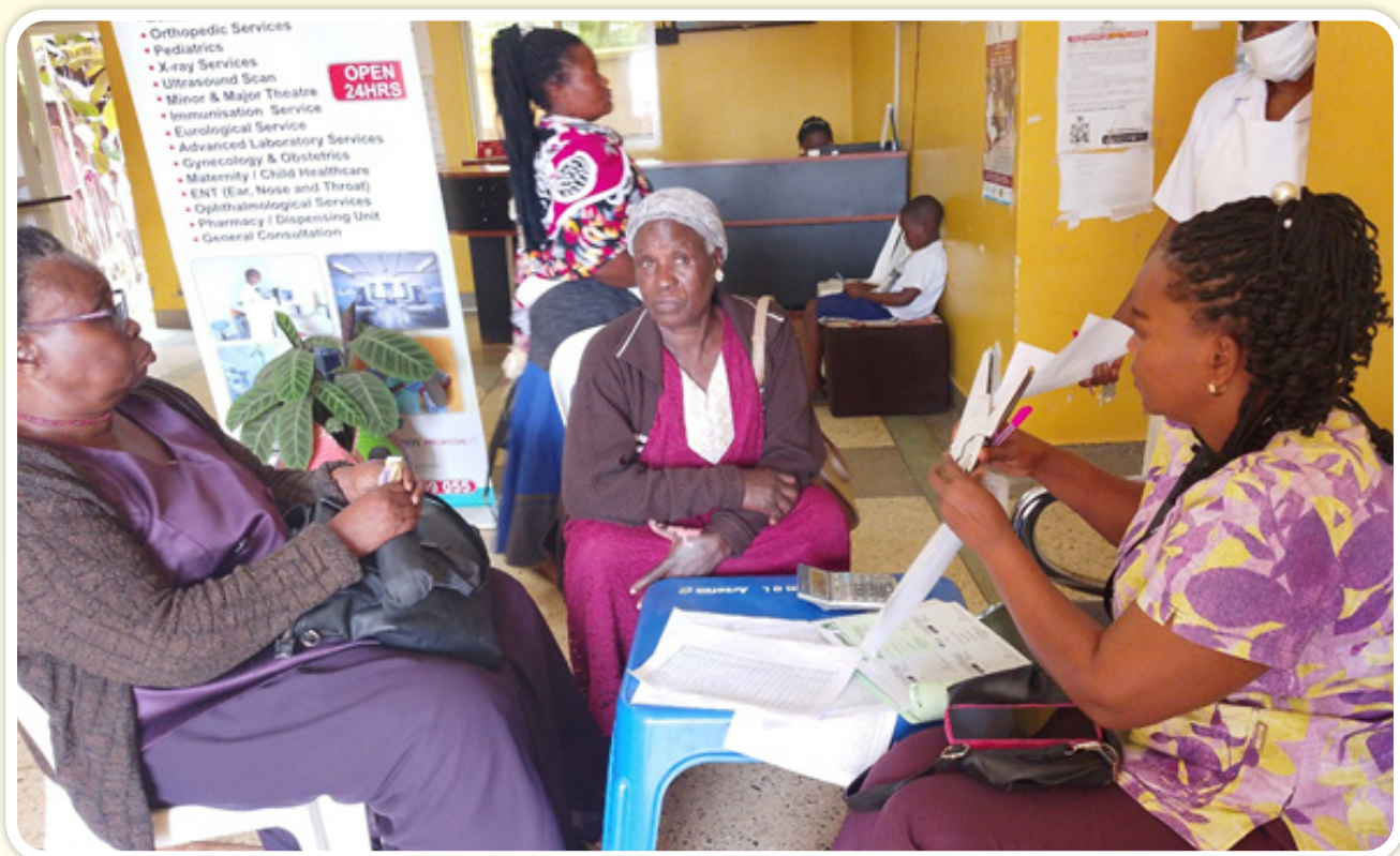
Patients Being Screened

incorporate routine health check-ups into their lifestyles. “This camp is intended to manage various illnesses and promote the importance of regular health screenings,” he stated.