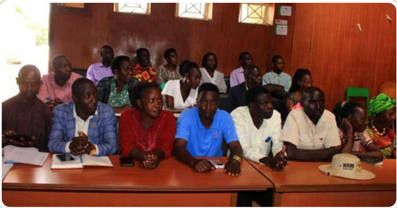
District technical wing at the meeting.

and any attempt to siphon them undermines the government's plan to reduce rural poverty.