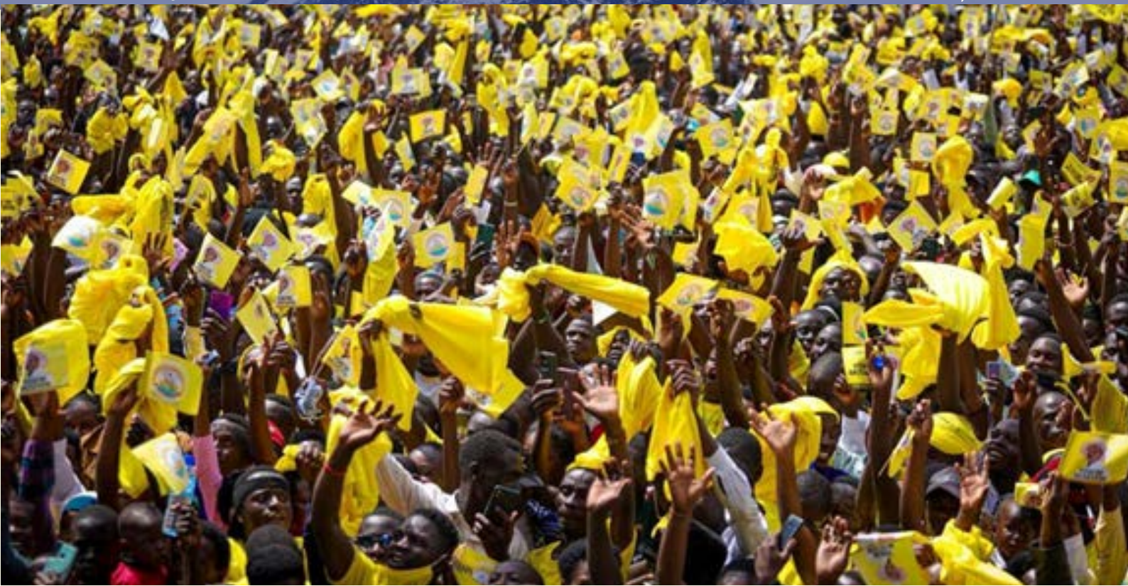
The overjoyed crowd at the rally.

He emphasised that wealth creation must start at household level: government programmes under NRM including the Parish Development Model (PDM) — are designed to lift households out of poverty and integrate them into Uganda's money economy.