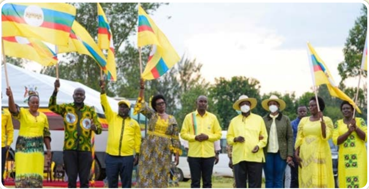
President Museveni poses for a photo with NRM Flagbearers from Fort Portal

contribution; wealth creation, the President gave the example of Tumusime Deziranta of Rubirizi, who lived near a tarmac road for 64 years but remained poor, illustrating that development alone does not create individual wealth.