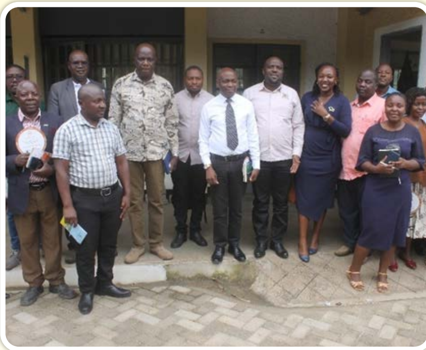
Land Commission and District stakeholders.

of a broader strategy to modernize land management across the country. He noted that integrating Kasese's public land records into the NLIS will boost accountability and eventually attract more investment into the municipality.