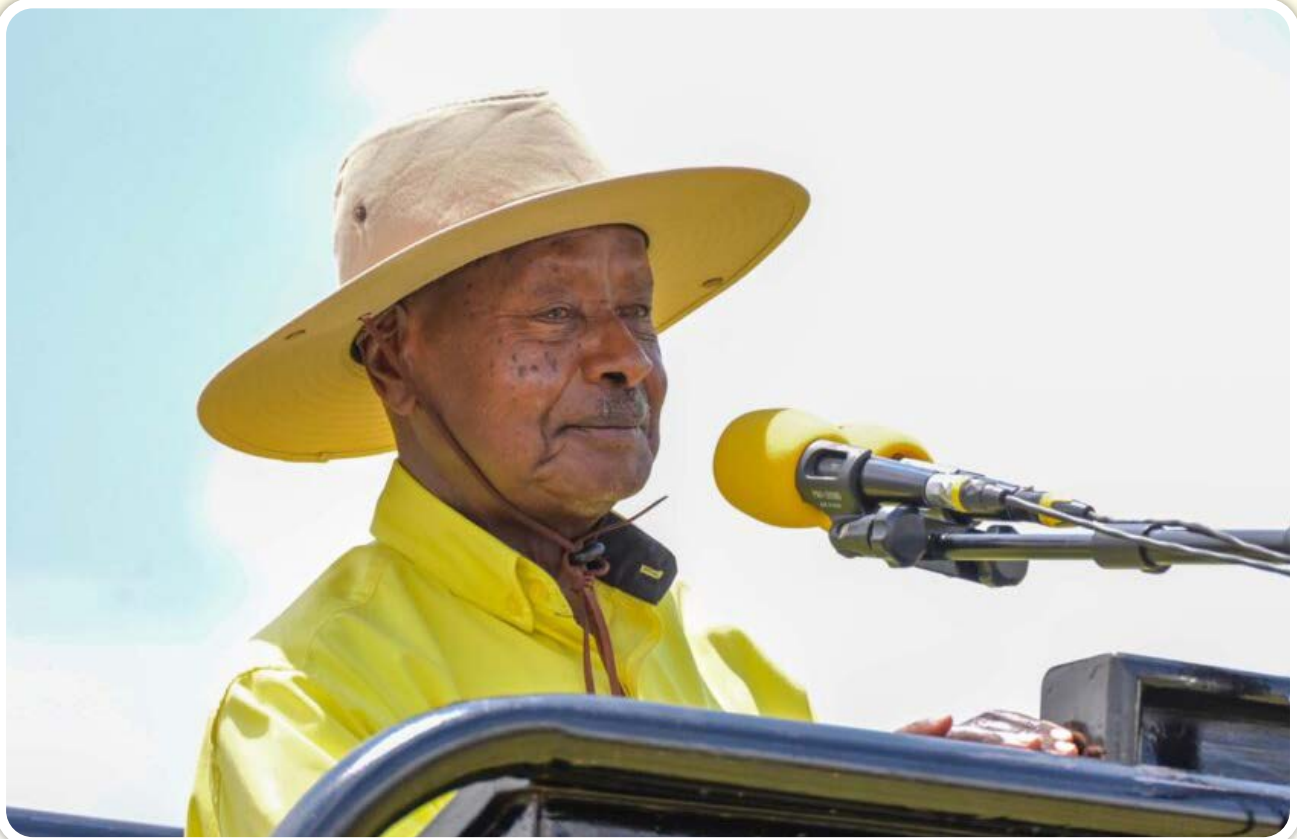
President Museveni addressing thousands of NRM supporters at Kyabenda Primary School.