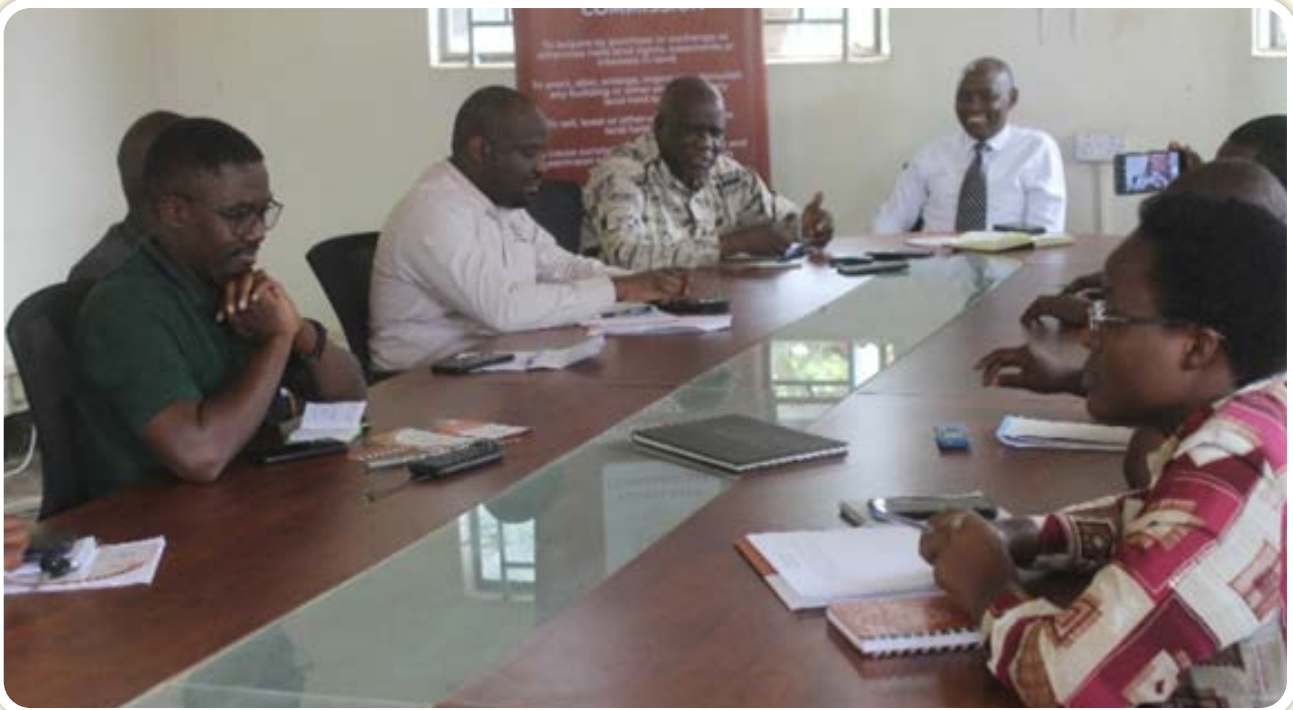
A team from land commission meeting with Kasese District and Municipality leadership.