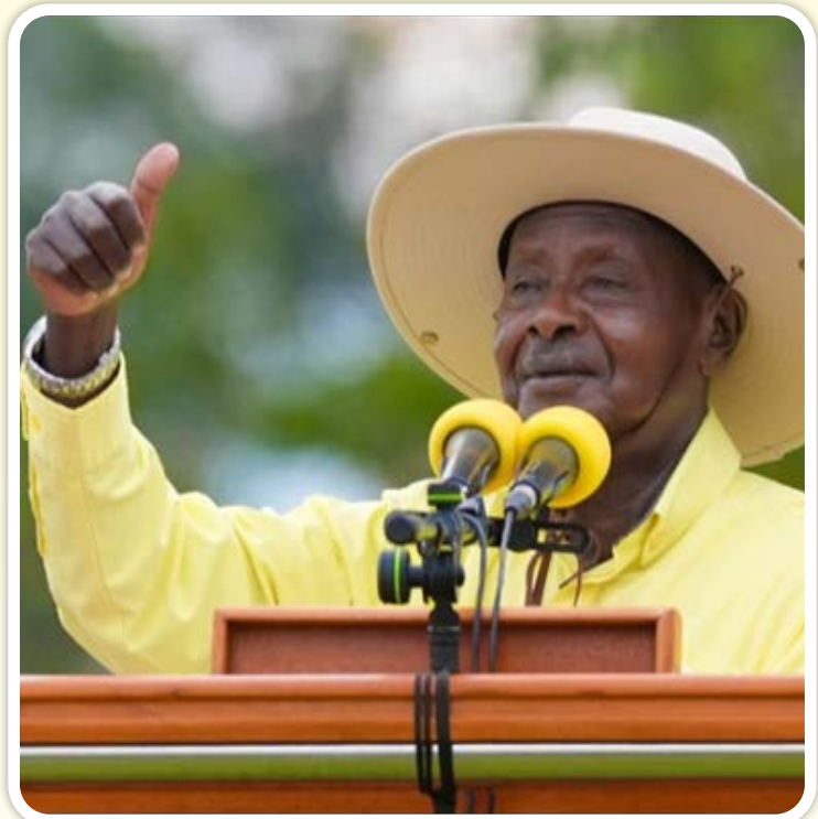
President Museveni addresses the people of Fort Portal and Kabarole

President Yoweri Museveni has reaffirmed peace, stability and inclusive development as the pillars of the NRM's legacy, reminding residents of Fort Portal City and Kabarole District that the Rwenzori region's progress is rooted in the rejection of sectarian politics and the building of strong national institutions.