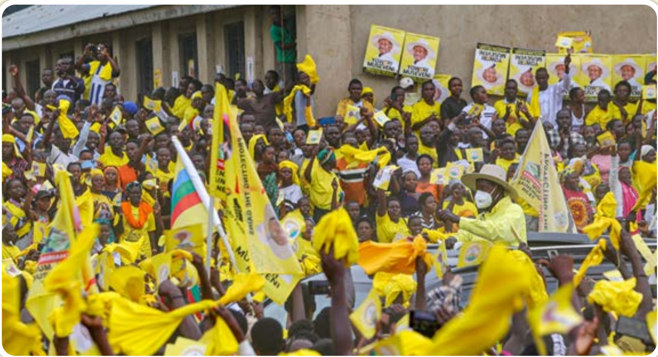
The massive turnout of NRM supporters