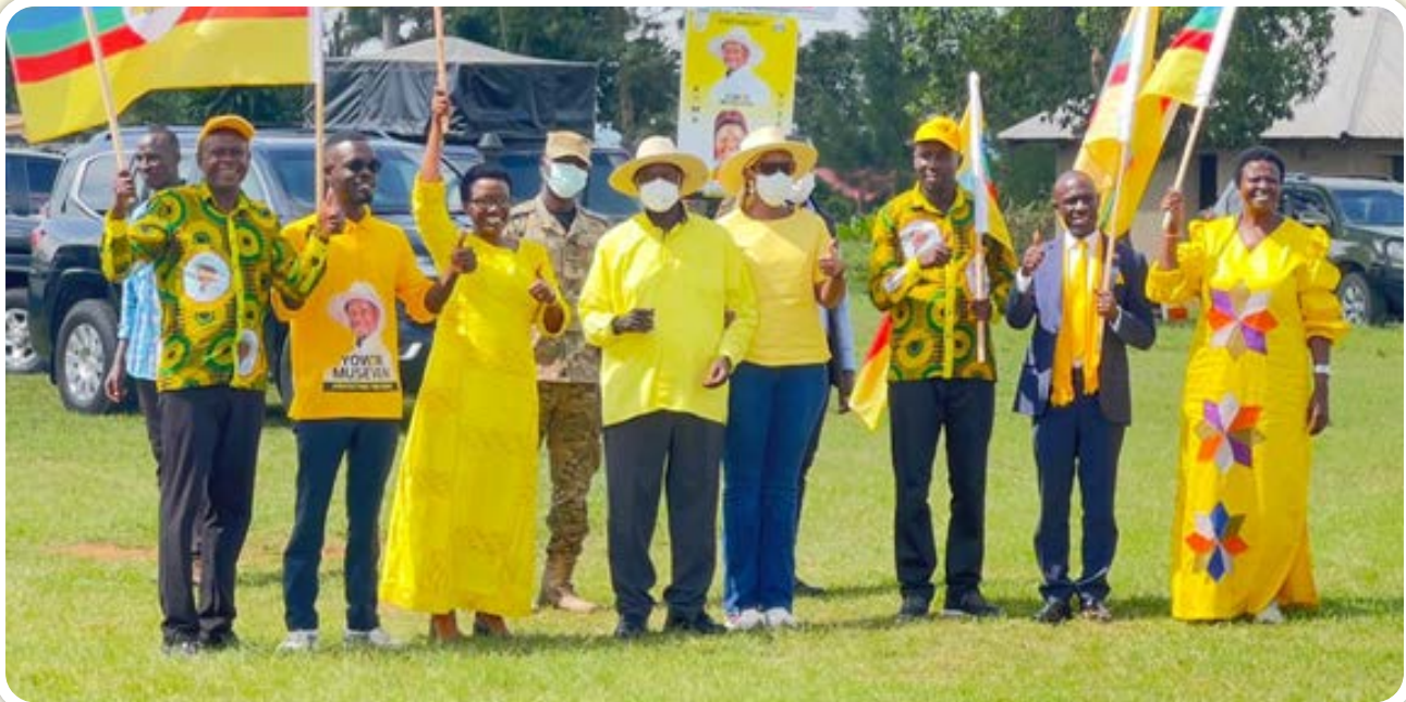
President Museveni poses for a group photo with NRM Flagbearers.