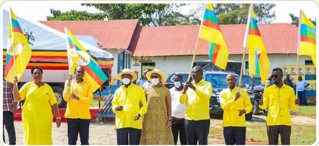
Museveni posing for a group photo with NRM flag bearers

He attributed the presence of many refugees in Kamwenge to ongoing instability across the border, which Uganda has consistently helped to manage through humanitarian support and regional peace efforts.