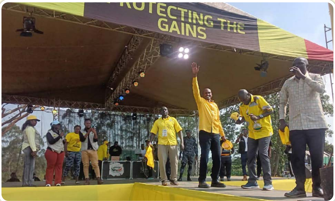
Honourable Frank Tumwebaze MP Kibale East & Minister for Agriculture animal industries & Fisheries waving to the NRM supporters.

arrangements as he campaigned for re-election.