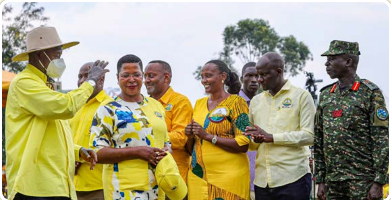
The President waves to district officials and aspirants during his Ntoroko rally.