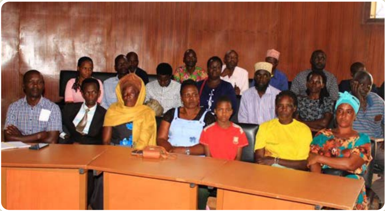
Some of the beneficiaries at the meeting.

the district. He further reaffirmed the government's commitment to fighting corruption within the PDM, emphasizing that civil servants implicated in malpractice would face stern action. He also emphasized more emphasis on following guidelines to implementation of the program.