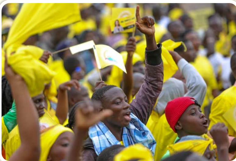
An excited crowd of cheers during the President's visit.

The President further thanked the people of Ntoroko for their resilience and support to NRM.