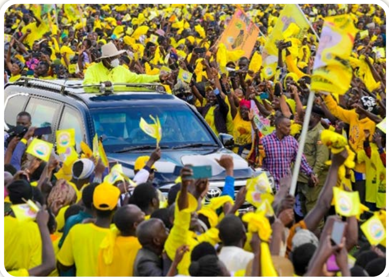
An excited crowd clad in yellow welcomes the President upon arrival at St. Leo's Kyegobe Playground in Fort Portal City.