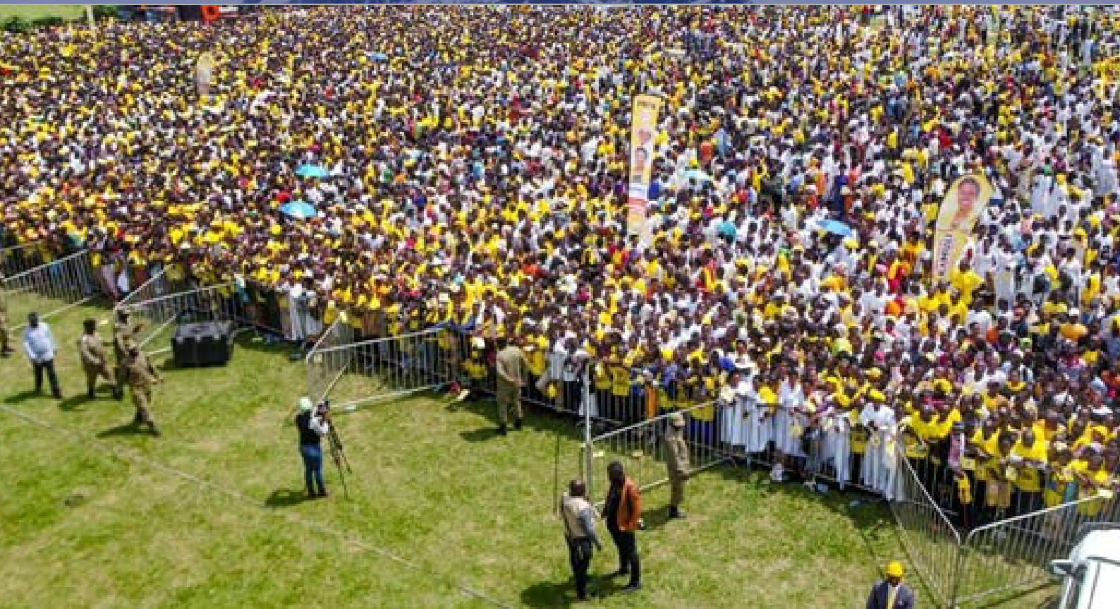
The mammoth crowd at the NRM rally.

On health services, Rt Hon Among expressed concern about congestion at Kyenjojo General Hospital, noting that the facility continues to receive a high number of patients from within and beyond the district. She appealed for support to secure additional land to allow expansion and modernization of the hospital.