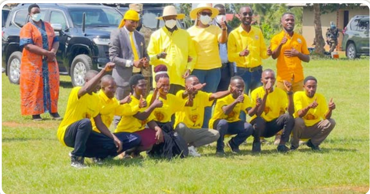
The President in a group photo with some of the students of Kijwiiga skilling hub.

“We thank you for ensuring that this road has been captured under NDP IV. It gives us confidence that the people of Kyenjojo have been heard,” she said.