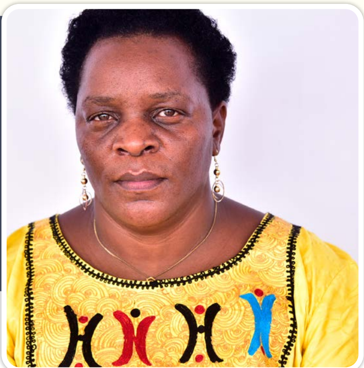
Hon. Peace Regis Mutuuzo, Minister of State for Gender and Culture

Representing the United Nations, Paulina Chiwangu emphasized the growing threat of digital violence, reminding participants that online