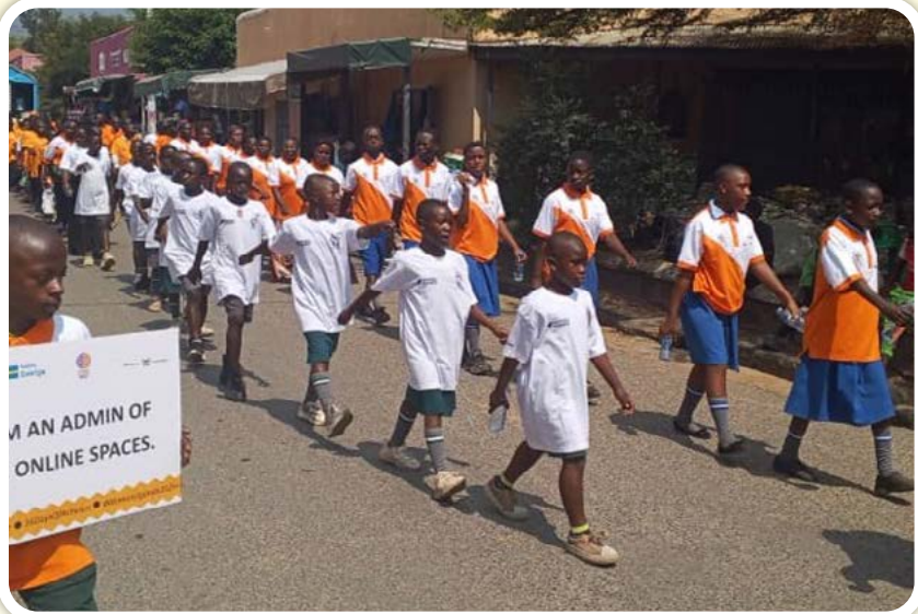
Procession at the 16 days of activism campaign launch