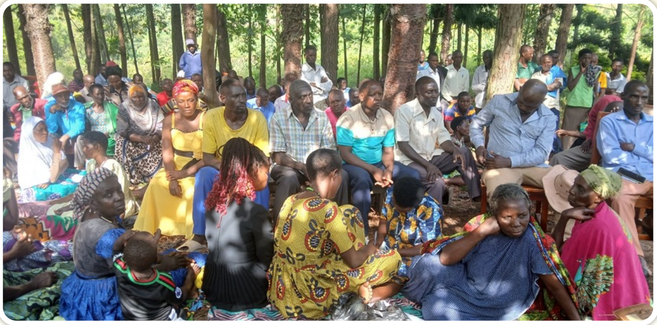
A section of Community members at the Launch in Kanara Parish