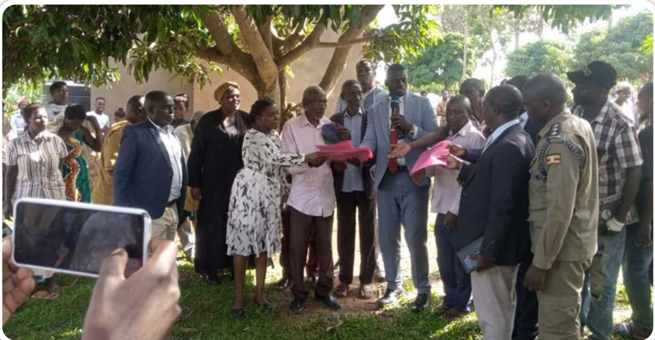
RDC Launching with Local Leaders in Rwenkubembe