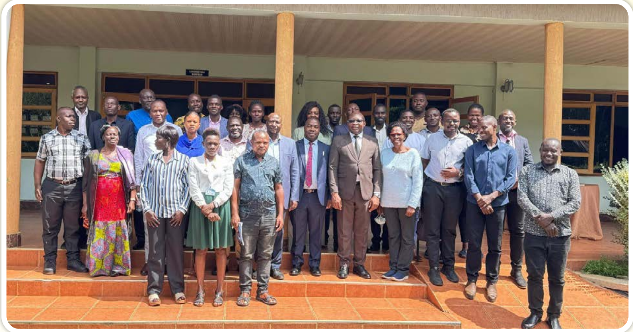
Makerere Dons and UPU Staff Pose in a Photo After the Training at Kalya Courts Hotel.