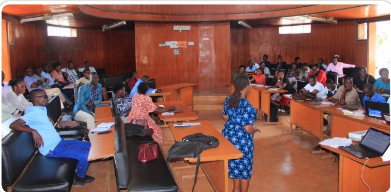
PARISH CHIEFS & CDOs in the training

Kyenjojo District, which comprises 19 sub-counties and 12 town councils, has long grappled with challenges such as incomplete data, inconsistent reporting, and scattered information on household livelihoods. Through SPEAR, the district expects to compile a unified database capturing dominant