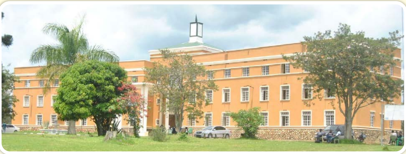
Front View of Uganda Pentecostal University

since we started. Law is attractive, wide, and offers better chances of employment. We've welcomed doctors, teachers, business people, religious leaders, and government officials who come to study law," she explained.