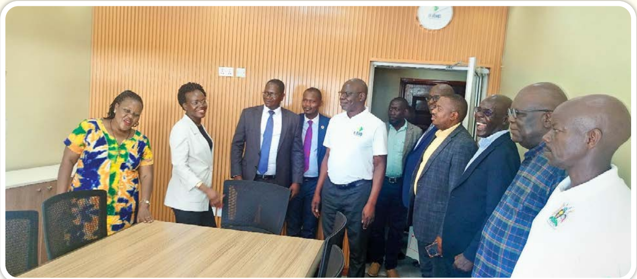
The Managing Director UDB takes the guests through the office

The UDB launch ceremony was graced by Hon. Jennifer Namuyango, the State Minister for Bunyoro Affairs. The minister remarked that this strategic expansion is set to unlock the region's vast economic potential, leveraging opportunities in key sectors such as agriculture, oil and gas, and tourism.