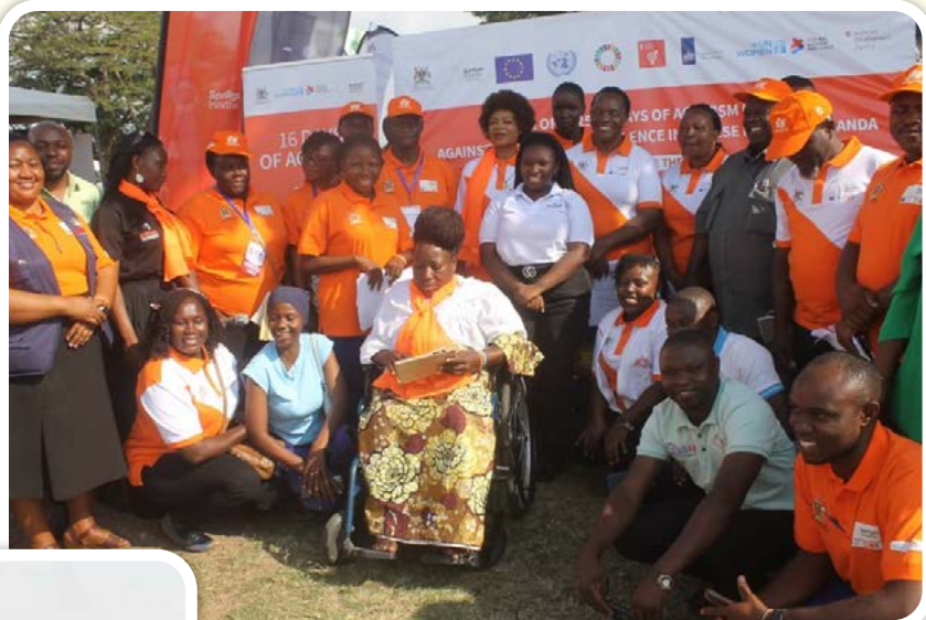
Actors at the 16days of activism campaign launch