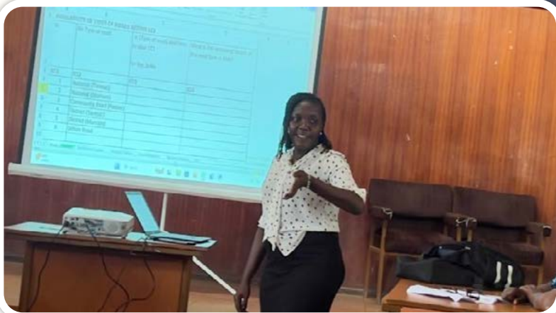
The District Planner, takes through the participants in the training

With this training and capacity of the participants built, Kyenjojo District reaffirms its commitment to improving statistics management and ensuring that parish data effectively informs government planning processes for better service delivery. With SPEAR's digital records feeding into district reports, leaders believe it will also significantly enhance transparency and accountability for PDM funds.