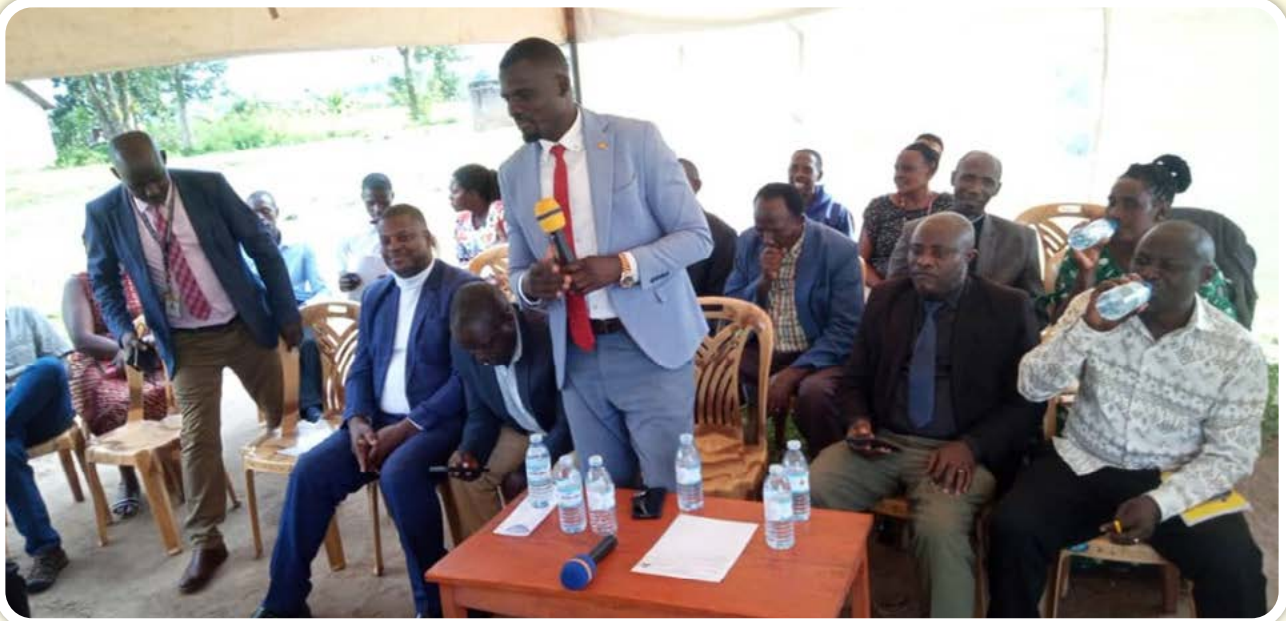
Deputy RDC giving his speech

In response, district leaders and health officials have launched a one-year campaign focused on four villages in Rwenkubembe Parish to address these challenges. Kitagwenda District has a latrine coverage rate of 87%, while Nyabbani Sub County's coverage is at 68%. However, Rwenkubembe Parish lags significantly behind with a latrine coverage of just 45%.