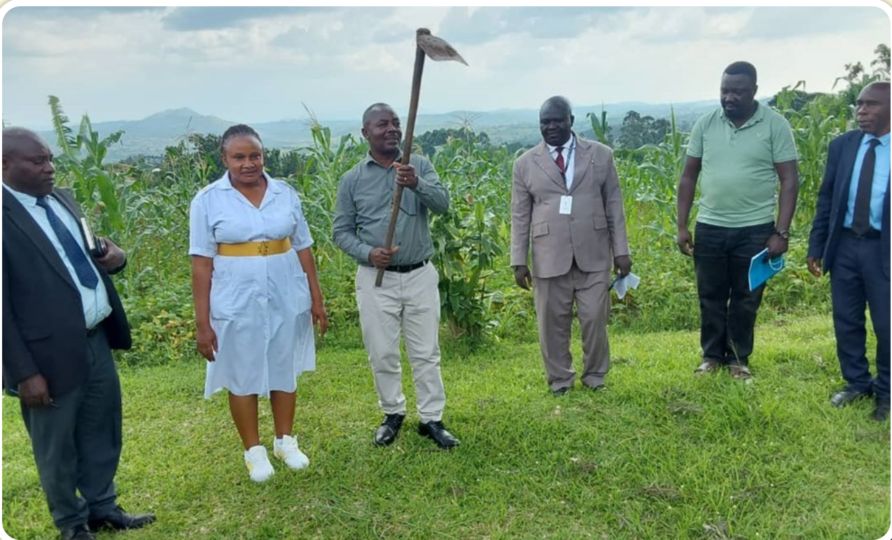
Ground breaking for construction of incinerator by RDC

is designed to improve equitable and effective service delivery in Education, health, Water and Environment and Micro Scale irrigation. “Under Health, already a lot of funds have been injected at this health facility and this is additional whose objective is to modernize it to a standard health facility capable of providing best health services to the people. The Total project Cost is 230 million and 120M of this will be used to procure Solar Back Up system for sterilization, lighting and refrigeration,” Dalili said.