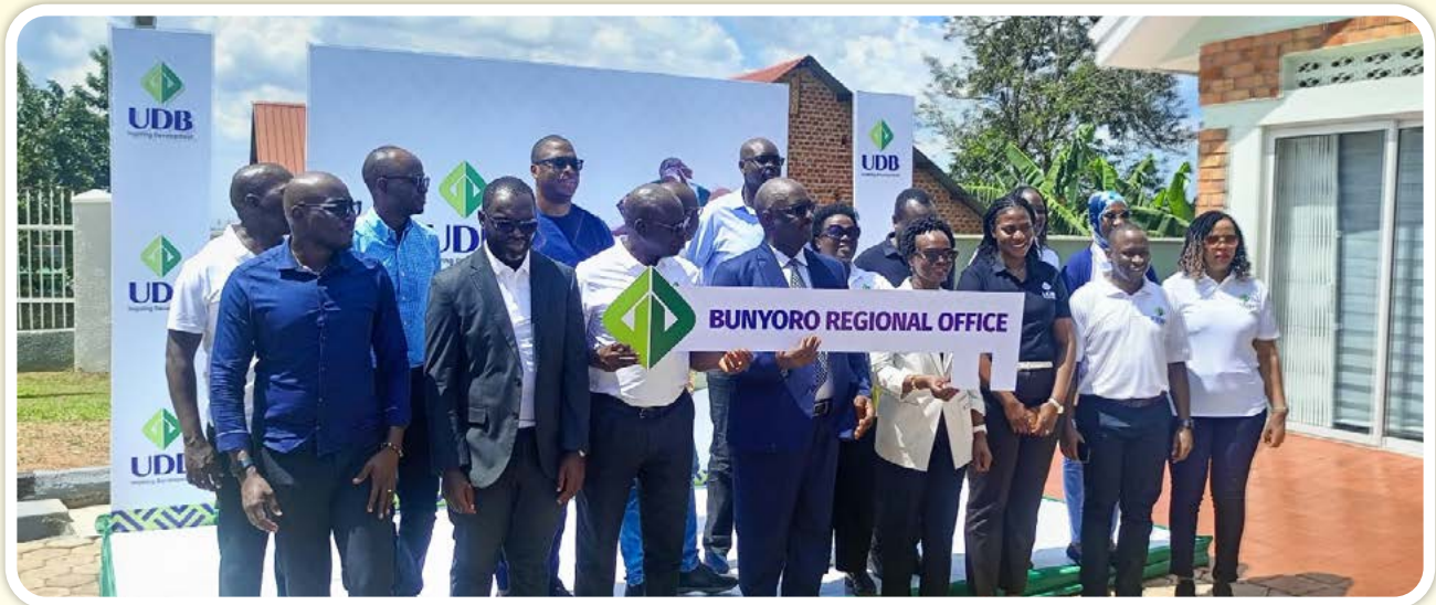
Launching the UDB Branch in Hoima City, Bunyoro Kingdom

to expand and establish Kabalega Resort. “UDB found us with only 29 rooms at Kabalega Resort Masindi, but now we have over 60 rooms, and we are still growing with the bank. The bank's financing has enabled our resort to achieve a three-star rating and rank among the top 47 hotels in Uganda,” he stated.