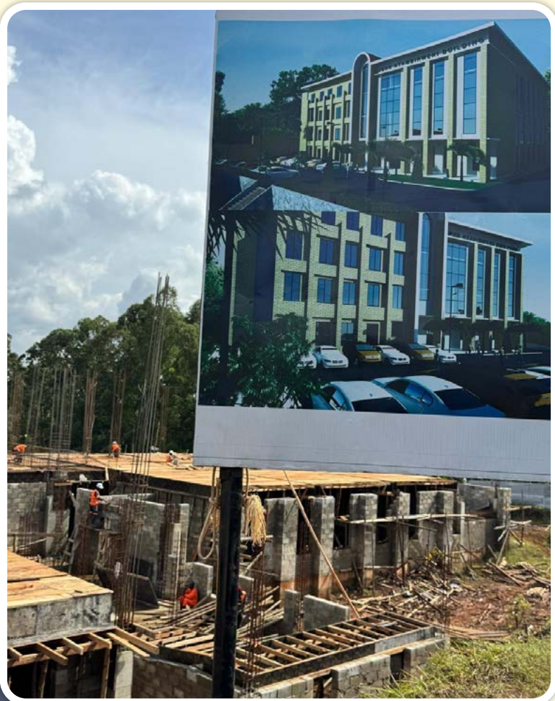
The UPU New Campus in Kihembo

The ceremony will also provide an opportunity to celebrate the university’s notable achievements in research, community engagement, and academic excellence throughout the past year. Set within the serene and scenic environment of Fort Portal Tourism City, this year’s graduation promises to be a memorable and dignified celebration, honouring not