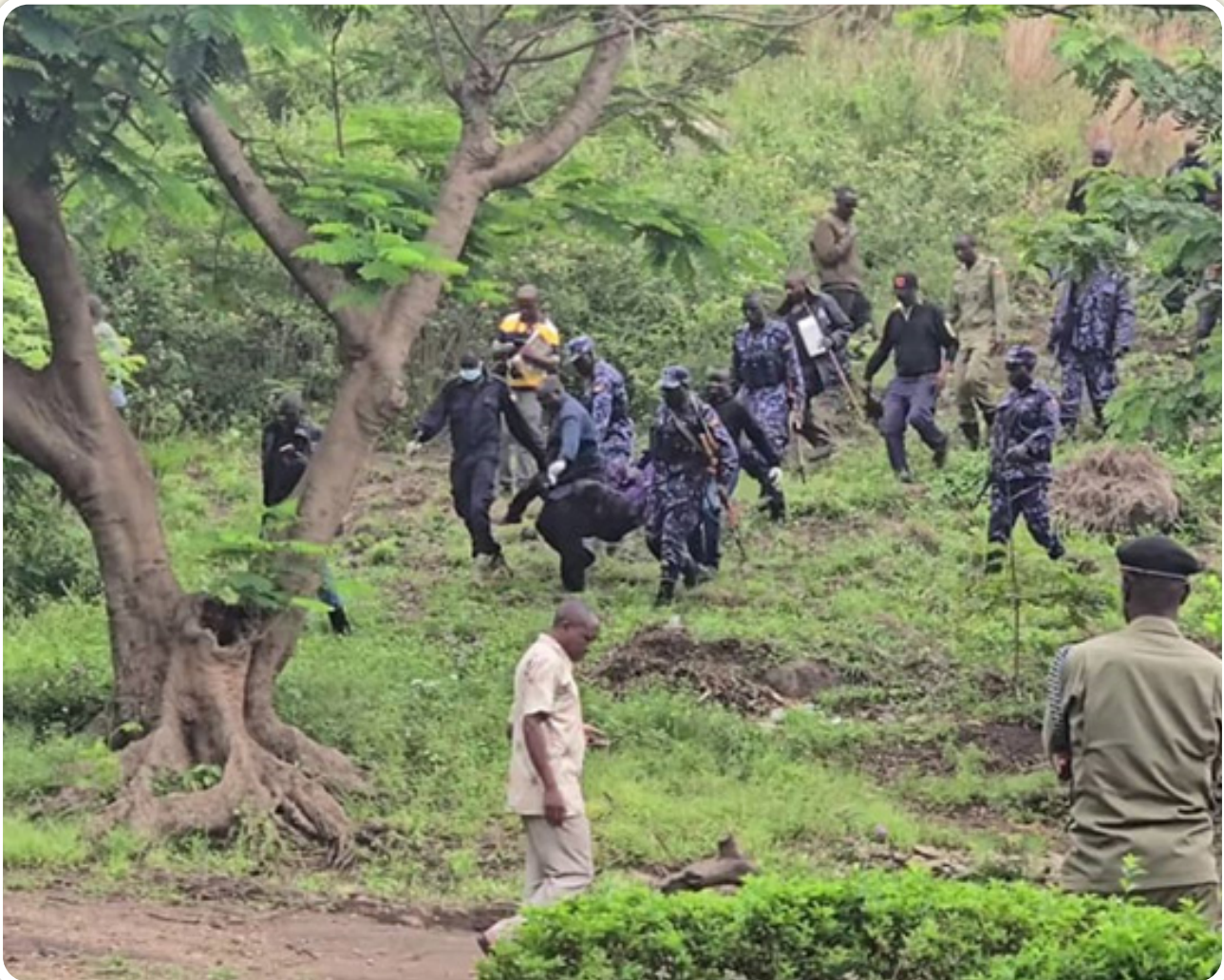
Military combs through the bushes retrieving the bodies of the victims of the attack.

The violence in the Rwenzori region resulted in the deaths of at least twenty suspected attackers and the arrest of thirty-five others, showing the urgent need for community cooperation in maintaining security and stability.