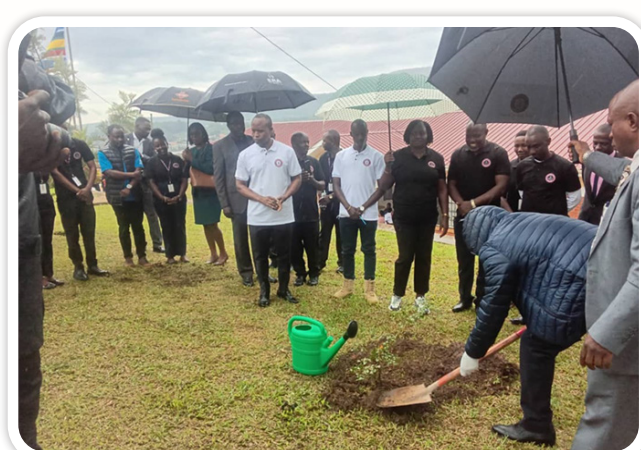
Chief guest Justice Zeija planting a tree at court premises.