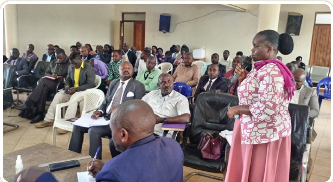
School Head Teacher Raises Her Concerns

The recent attacks have highlighted the urgent need for enhanced security measures in Rwenzori schools, prompting a collective call for action to protect students and educational institutions from potential threats.