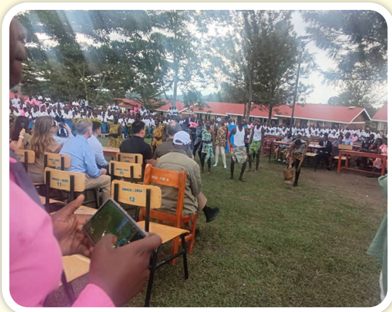
Guest being entertained by Congolese students at Rwamwanja S.S