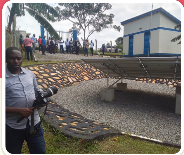
The Kinombe water project in Kasenda sub county.

K abarole District is making significant strides in improving public health and access to clean water, thanks to the launch of a 1.2 billion-shilling water project aimed at reducing the prevalence of Bilharzia in local communities.