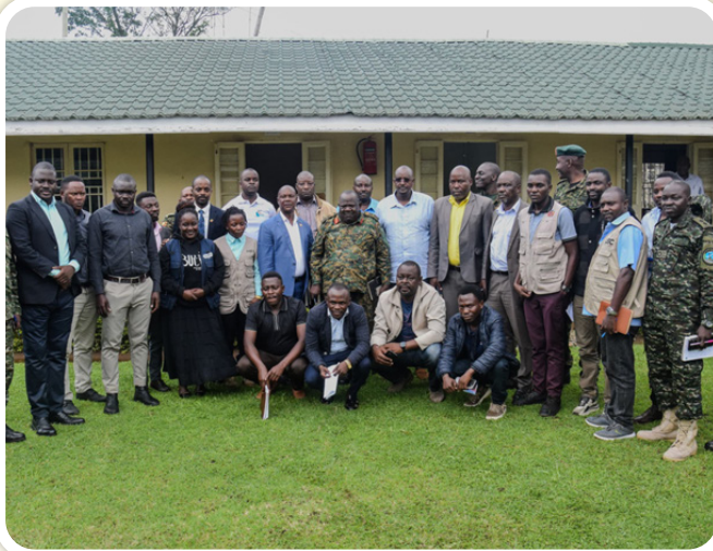
Journalists and security personnel pose for a group photo after the meeting at Muhooti barracks on Tuesday.