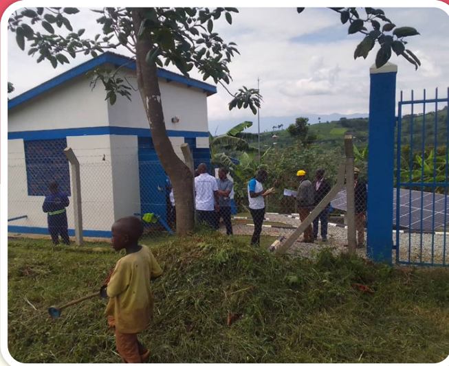
The commissioned water project in Kasenda.