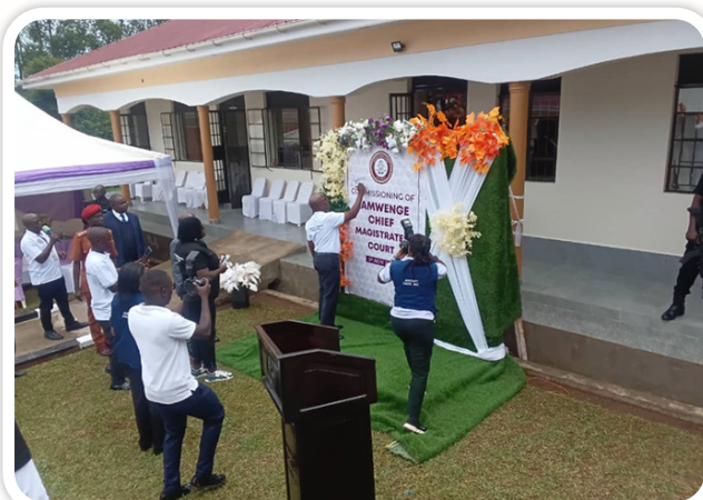
Chief Guest Signing on the board.

She also encouraged the public to seek justice through official courts and avoid "bushy lawyers" who exploit citizens