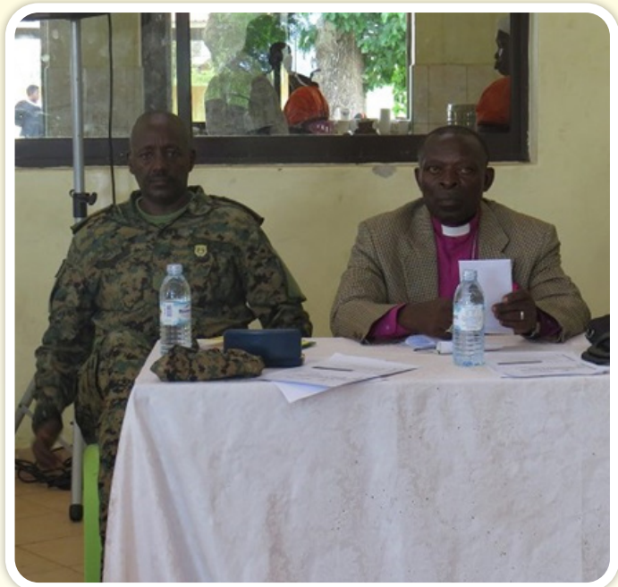
District officials, religious leaders participating in the budget conference.

Hon Muhindi's address was a call to action urging all stakeholders to look