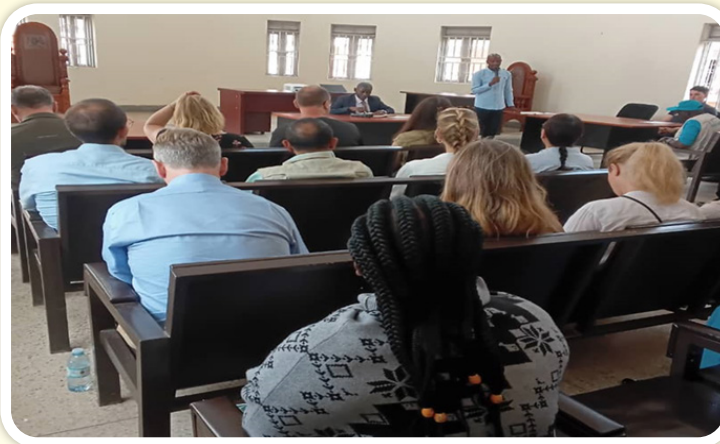
District chairperson welcoming the visitors in the council hall