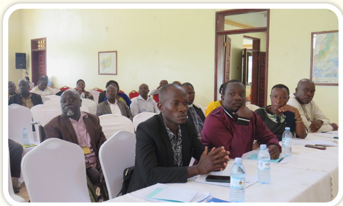
Stakeholders participating in the Budget Conference.

beyond numbers and see the lives behind each allocation. The district's Shs 120.1 billion resource envelope, comprising locally raised revenue, central government grants, and donor funding, will directly target areas that touch everyday livelihoods. Among the top priorities are: