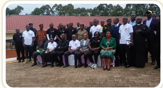
Chief Guest with invited dignitaries

customer care, timely delivery of judgments, anti-corruption practices, and strong stakeholder engagement. He also thanked the Mayor of Kabujogera for allocating land to establish another court in Kitagwenda, reiterating that these facilities are key to bringing justice closer to the people.