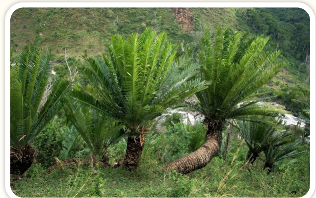
cycad trees in kitagwenda

Mpanga Falls, as it approaches where the river empties into Lake George. The cycads grow at elevations of about 1,000 to 1,300 meters above sea level. Encephalartos whitelockii forms one of the largest single cycad colonies in Africa. It is estimated that there are about 8,000 mature individuals in its known habitat.