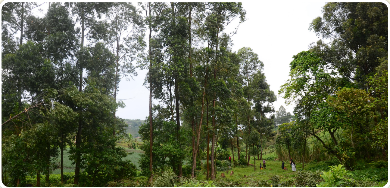
Encroachers had planted eucalyptus trees in parts of the wetland. The trees were cut down during an enforcement operation

By Christopher Tusiime, Communications Officer, Bunyangabu District