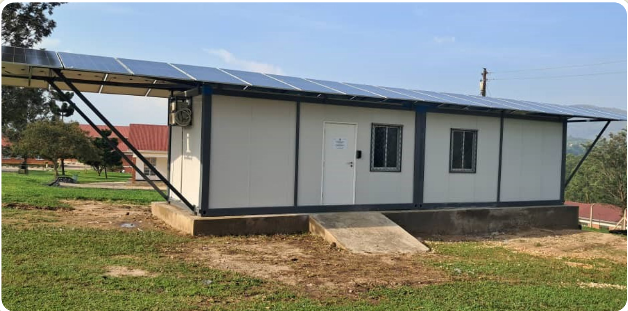
containerised cold chain facility