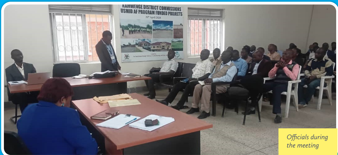
Officials during the meeting