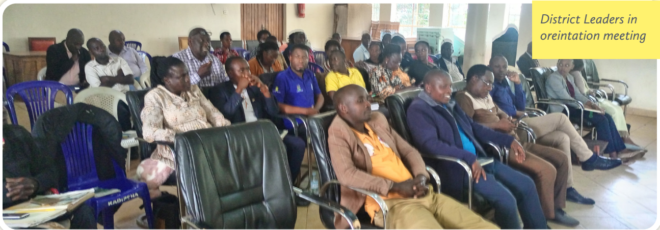
District Leaders in orientation meeting