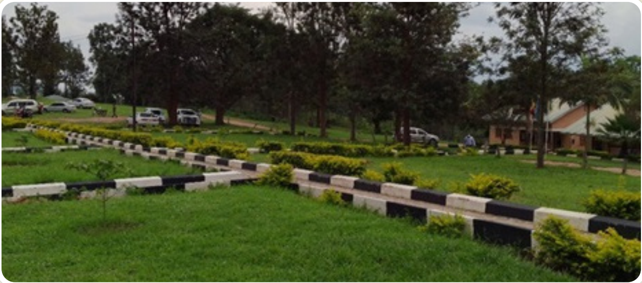
Kitagwenda district headquarters