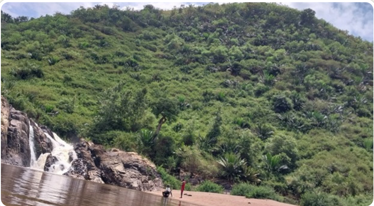
cycad village in karubuguma kitagwenda district

Conservation efforts are underway to protect these incredible plants and their habitats. The local authorities, in collaboration with environmental